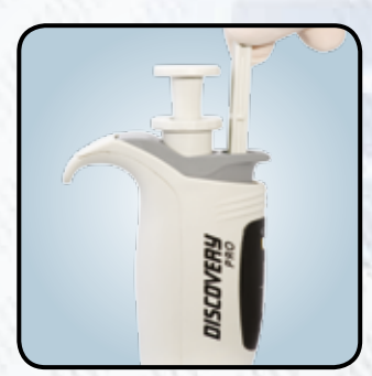
Insert the calibration key into the ejector orifice. Turn the key so as the volume indicated by the counter is equal to the average calculated volume. Refer to the user manual for details.