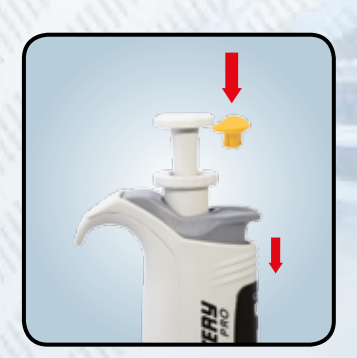
Remove the calibration key and set the calibration switch in its lower position. Place the cap on the ejector button.