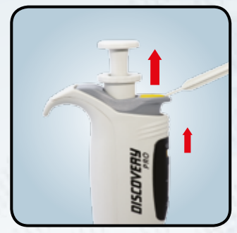
Lock the volume setting knob. Remove the colour cap using the calibration key. Set the calibration switch in its upper "CAL" position.